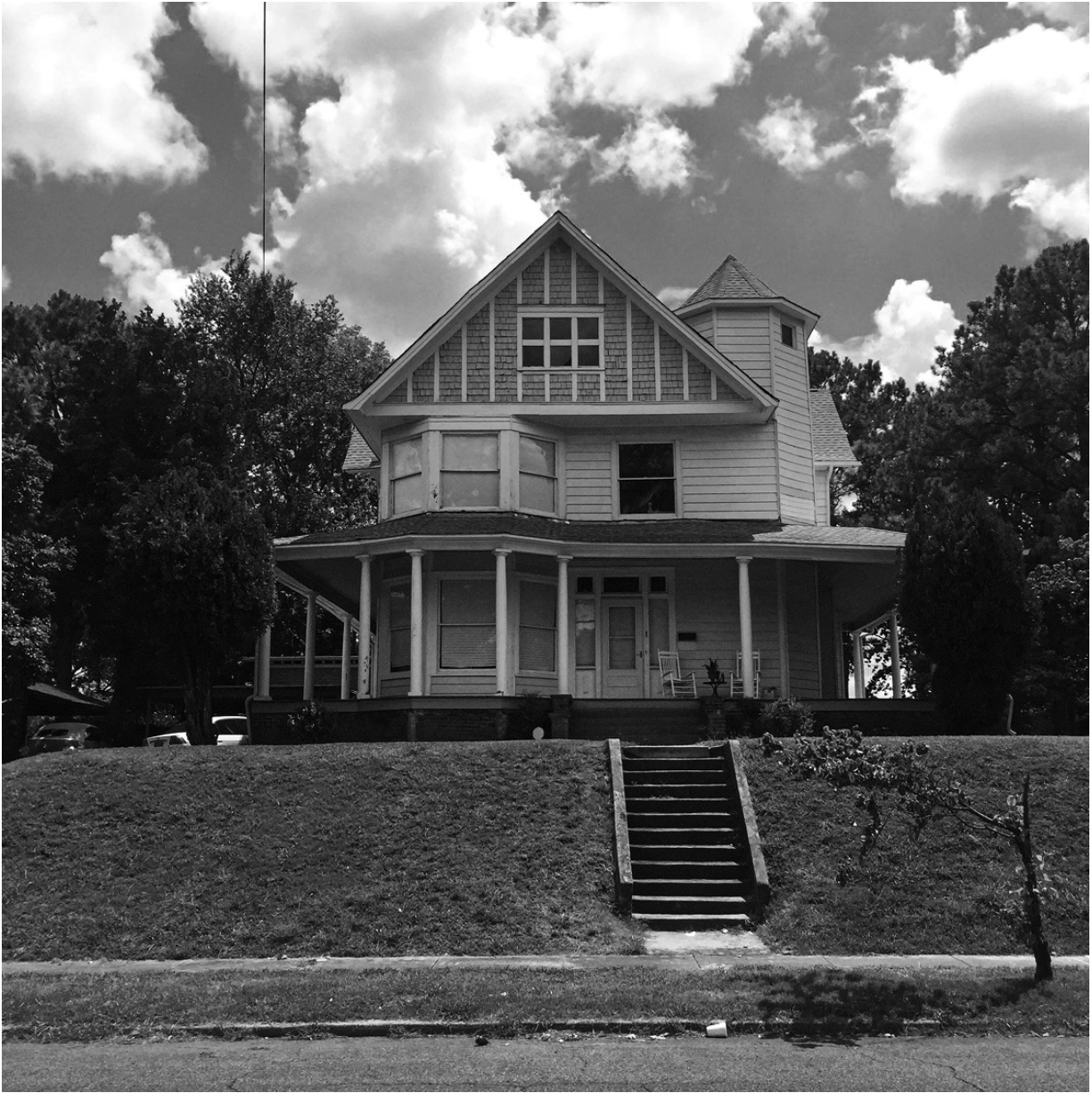
The childhood home of Angela Davis on “Dynamite Hill” in Birmingham

Warrantless wiretapping, relatively easy access to tech giants’ servers, and collection of our communication data present special challenges for those of us whose very existence is suspect and revokable by the state. Over time, Black people have been given no choice but to circumvent and reject borders, prisons, and police, both physical and digital.