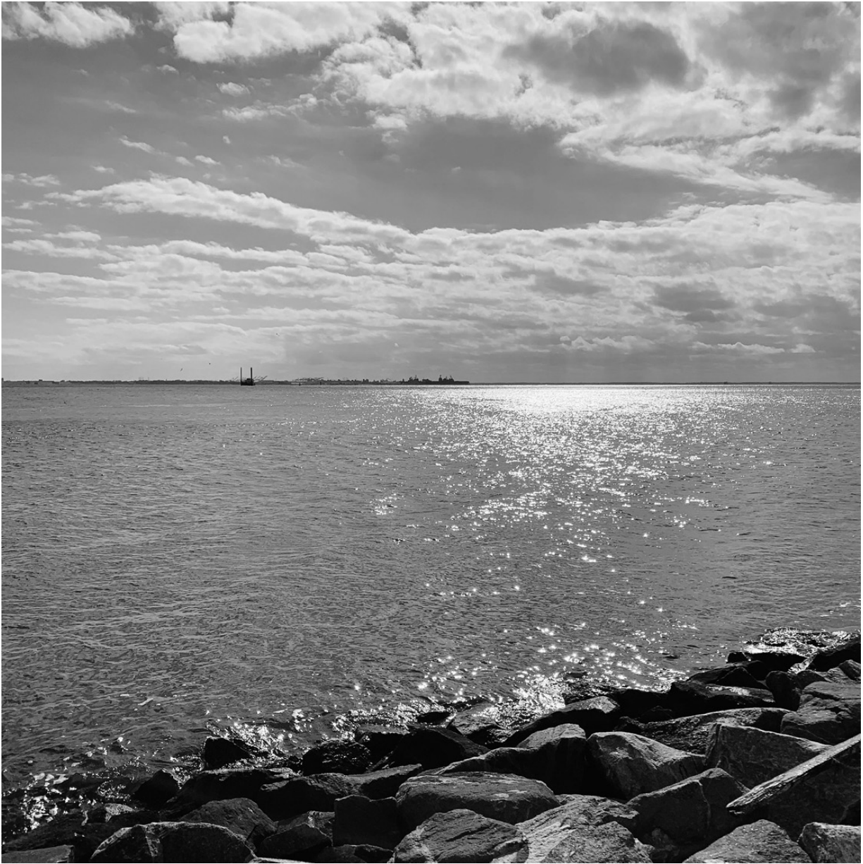
Point Comfort at Fort Monroe in Hampton, Virginia. The site of the 1619 landing